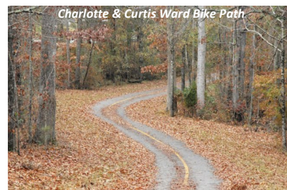
Charlotte & Curtis Ward Bike Path

CHEWACLA STATE PARK: Features a 26-acre lake, a swimming area, peaceful waterfalls, bike trails, hiking trails, playgrounds, campsite areas, picnic areas with tables, grills with shelters, and newly renovated cabins. The scenic 696-acre park includes eight trails including a mountain bike trail and the Charlotte and Curtis Ward bike path which consists of 3 miles along Shell Toomer Parkway. The main entrance to Chewacla State Park is located in the city limits of Auburn 1.5 miles southeast of Exit 51, Interstate 85, off of Shell Toomer Parkway. http://www.alapark.com/chewacla