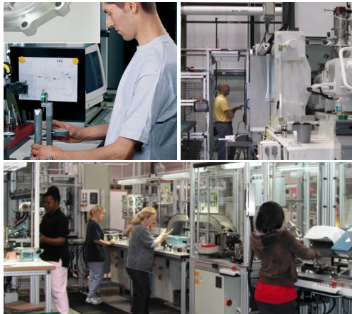
AUBURN'S TOTAL WORKFORCE CONSISTS OF 28,000 WHICH INCLUDES 5,000 JOBS IN MANUFACTURING.