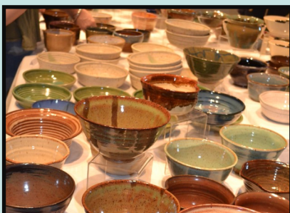
Photo XX Juried Photography Exhibition March 25 - April 30

Annual Graphic Design Juried Exhibition March 4 - 8